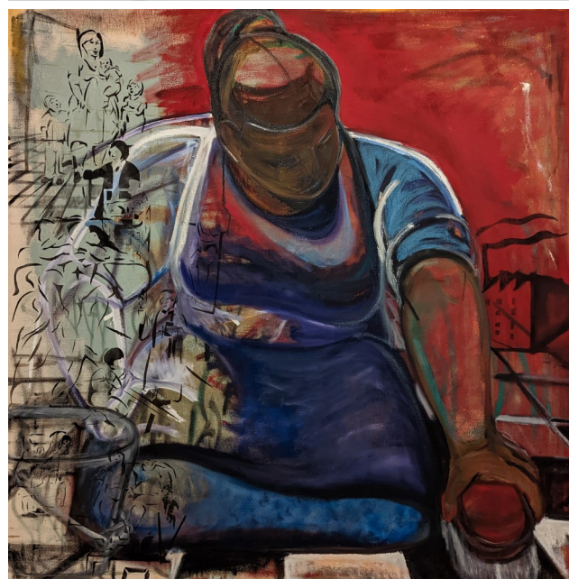
Image credits: (cover) Exhibition installation image by Tito Ruiz | TRu iNk Media, LLC®; (this page from top to bottom) Josh Iguchi, Crucifixion , 1993, chromogenic print and mixed media; Unknown Artist(s) Wall Hanging (made from a Velum), c. 1910, silk brocade with metallic tassels; Saul Ostrow, A Woman's Day is Profitable (A Snapshot) , 1984, oil on canvas.