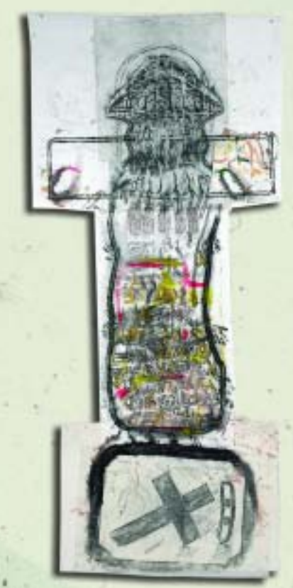
Grave Series #27, 2002, wax and charcoal with tombstone rubbings on assembled paper, h. 80 inches.