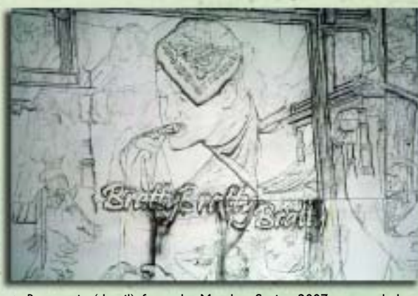
▲ Bagenstein, (detail), from the Messbag Series, 2007, wax and charcoal with tombstone rubbings on assembled paper, w. 80 inches.

Detail of performance installation, Messbag Series, 2007, including mixed media, found objects, and video documentation.