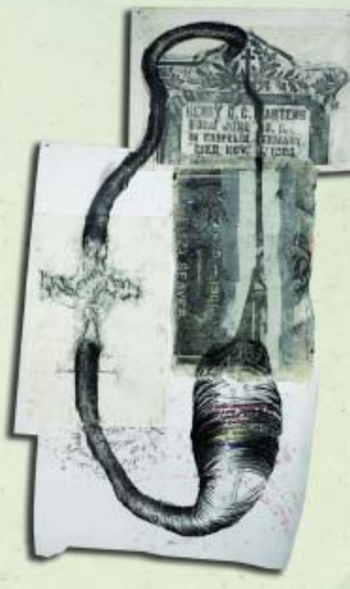
Grave Series #33, 2002, wax and charcoal with tombstone rubbings on assembled paper, h. 60 inches.