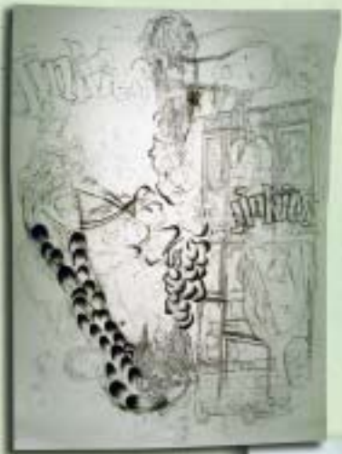
▲ Jinkies, from the Messbag Series, 2007, wax and charcoal with tombstone rubbings on assembled paper, h. 65 inches.