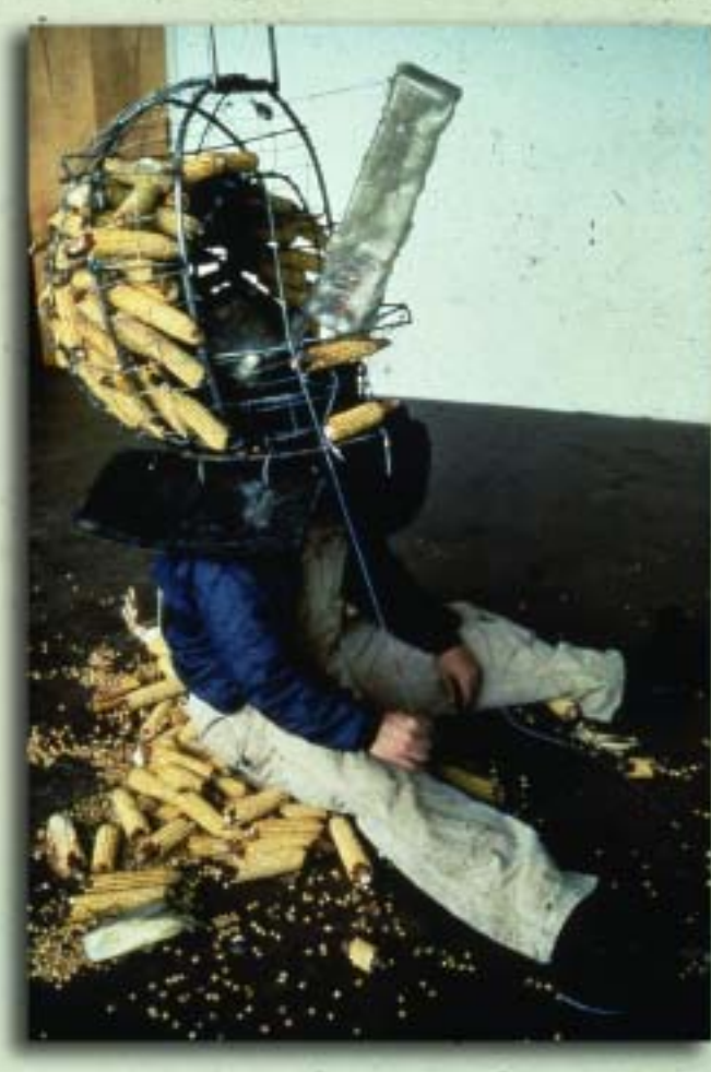
Corn Head (detail), 2000, Public performance with steel structure and corn.